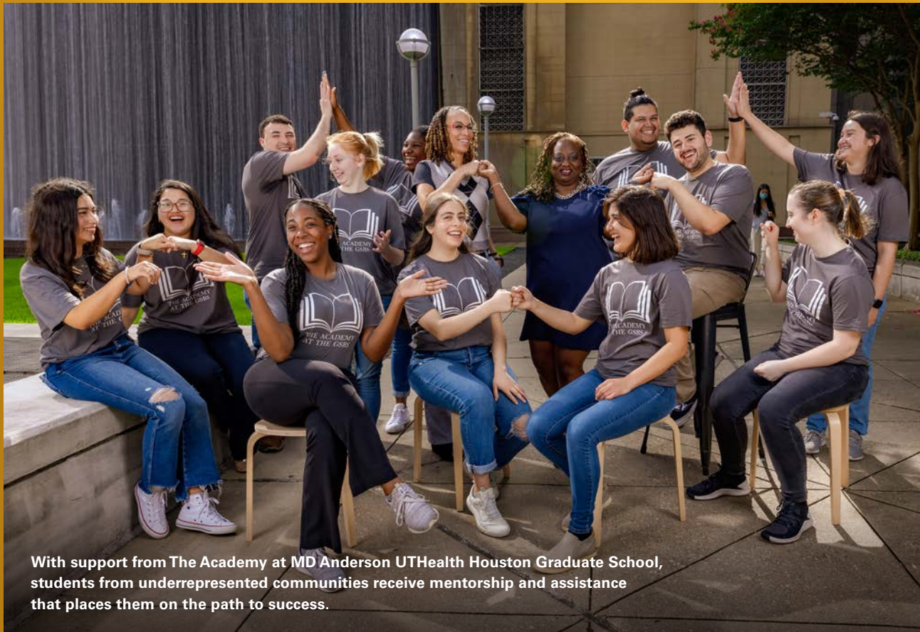
With support from The Academy at MD Anderson UTHealth Houston Graduate School, students from underrepresented communities receive mentorship and assistance that places them on the path to success.